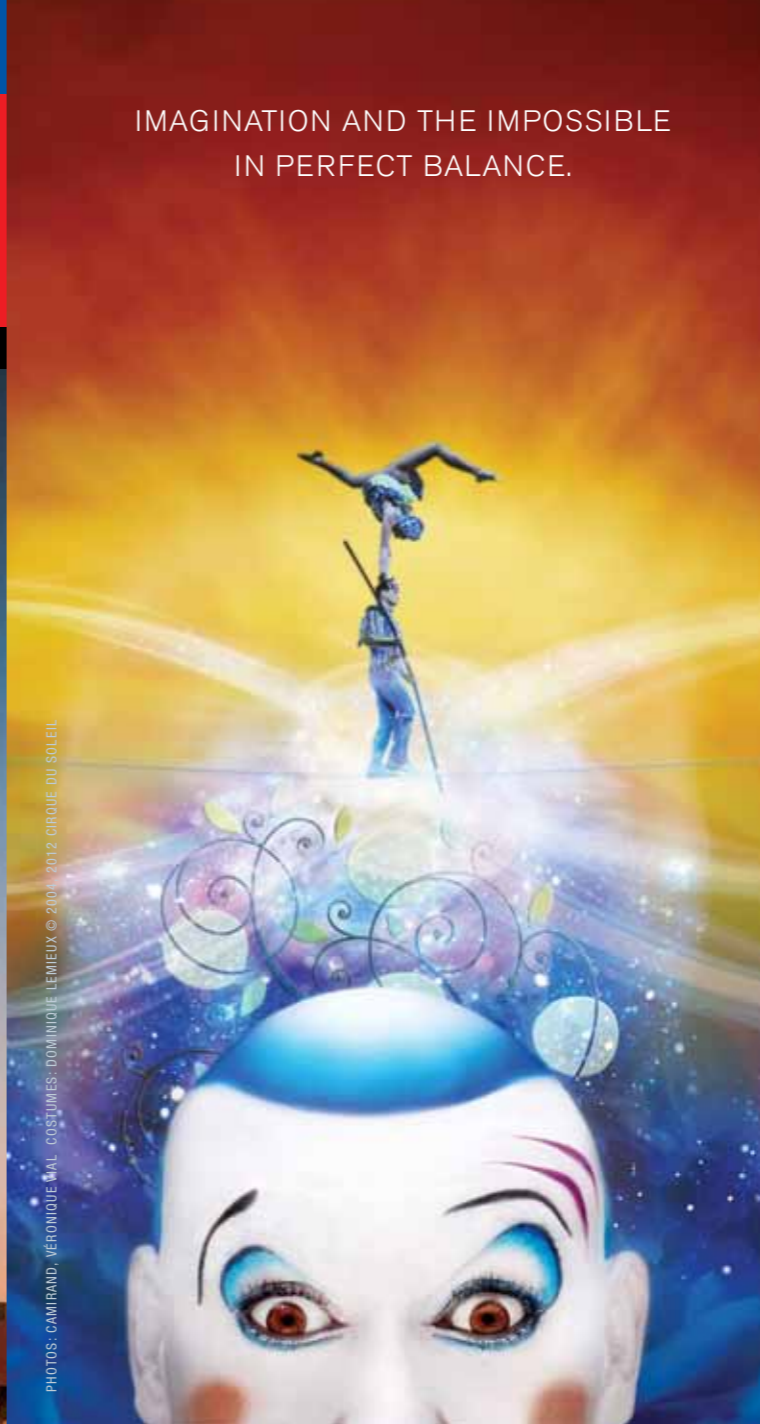
PHOTOS: CAMIRAND, VÉRONIQUE MAL, COSTUMES: DOMINIQUE LEMIEUX © 2004, 2012 CIRQUE DU SOLEIL

Marketplace • Pleasure Island • West Side