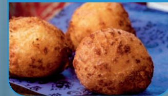
Royal Street Veranda