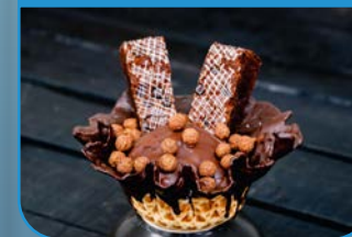
Clarabelle's Hand-Scooped Ice Cream