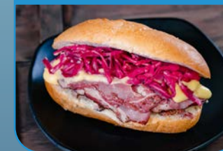
Pacific Wharf Café

Subject to availability. Valid park reservation and ticket for appropriate park required to pick up mobile order. Separate admission to certain locations may also be required.